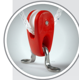
KITE BLOCK on Saddle