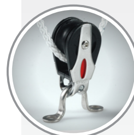
RF20101 on Saddle