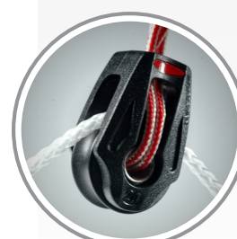
RF25109 on Lashing