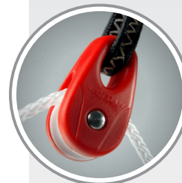
KITE BLOCK on 'Pigtail'