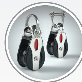
RF20101 with Shackle - 2 ways