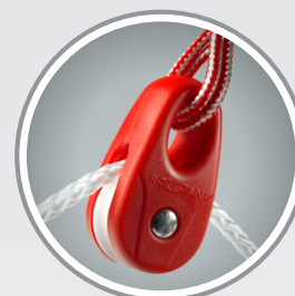
KITE BLOCK on Lashing