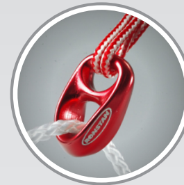
SHOCK on Lashing