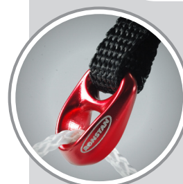
SHOCK on 8mm webbing

*1 Less than one third the weight of typical stainless steel thimbles. *2 Block must be lashed through hub. *3 Outer edge of block head to bearing point on sheave. *4 Approximately 33% less than stainless steel thimbles or alloy thimble/rings. *5 Rope capacity to 4mm (5/32") maximum. Dyneema is a registered trademark of Royal DSM.