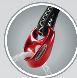
SHOCK on 'Pigtail'