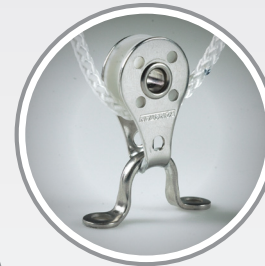
RF666 on Saddle