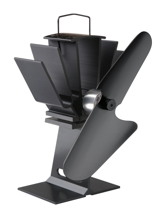
12% Cost Savings and Reduced Emissions