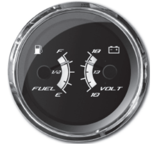
Scale may vary depending on model.

Let us be your solution for dash overload.