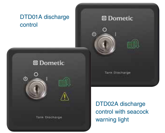
DTD Panel Dimensions - all models 3.25 in. w x 3.25 in. h / 83 mm x 83 mm

13128 SR 226, PO Box 38 I Big Prairie, OH 44611 USA I 330-439-5550 I Fax 330-496-3097 www.DometicSanitation.com | sealand@dometic.com