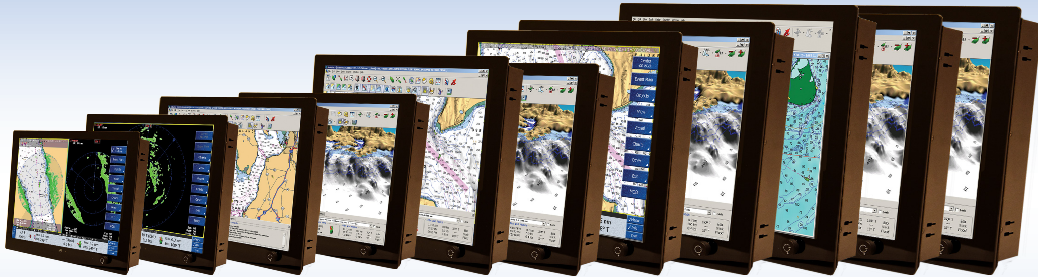
10" Display SRT/PHT-10

Sunlight Readable Touchscreen (SRT) & Pilot House Touchscreen (PHT) Displays Designed for the Industrial and Marine Industries.