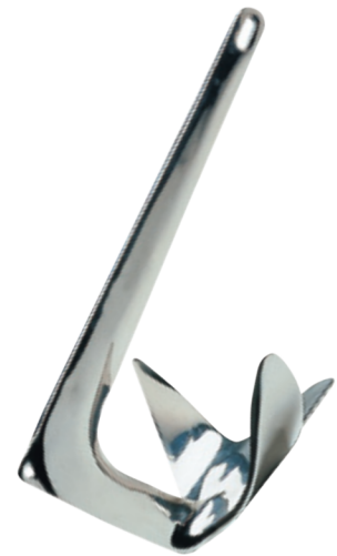
Stainless Steel Claw