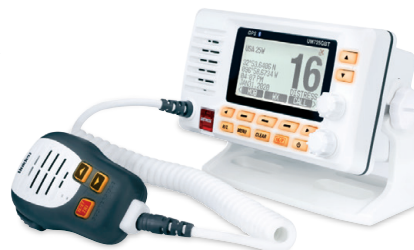
UM725GBT (White Model)