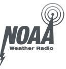
UM725GBT BK (Black Model)