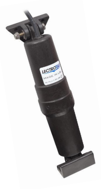
Short Actuator with Low Profile Bracket

Ideal for limited vertical height applications such as swim platforms, Lectrotab short trim tab actuators are precisionengineered to combine quiet operation with a non-hydraulic, maintenance free design. The unit is corrosion free, ensures very accurate tab positioning, provides maximum lift force, and is totally self-contained for easy installation. The actuator assembly is packaged in a non-metallic permanently sealed housing. No components need to be installed inside the boat. Most importantly, unlike hydraulic trim tabs, there is no oil to leak out. The short actuator incorporates either a standard or low profile (see picture) transom mounting bracket. Short actuators come in 12 and 24 VDC with 6 second stroke time.