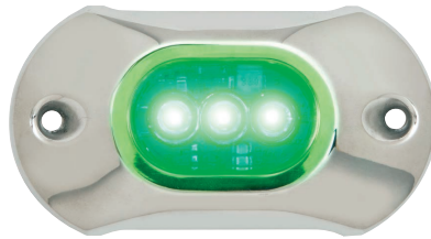
Tactical Green 65UW03G