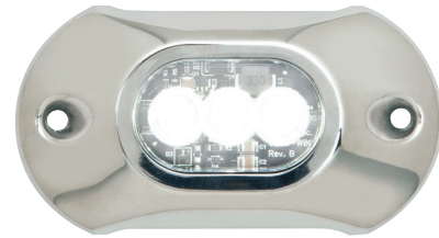
Intense White 65UW03W