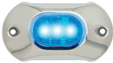
Sapphire Blue 65UW03B

NOTE: Bulk packaging does not include covers and aftermarket packaging does include covers.